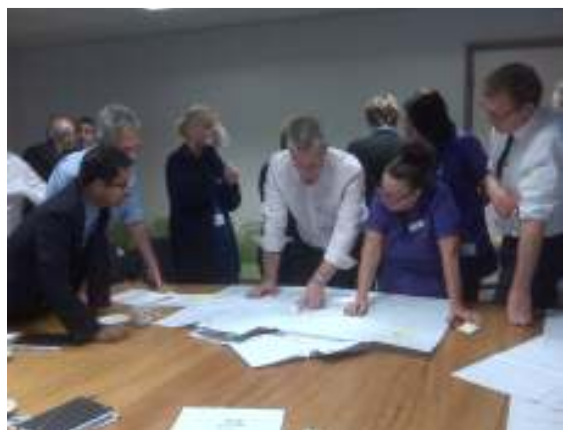
The Elective Care Services User Group at work